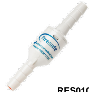
RES010 Firesafe Valve